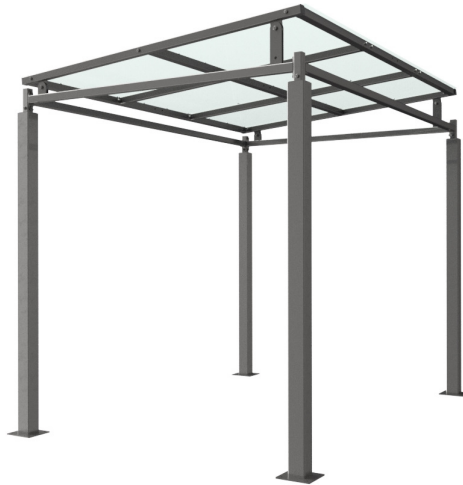
138 204 642 – 2x3 Bedford Shelter

The Bedford shelter is a free-standing, open sided shelter designed for on site assembly, constructed from galvanised mild steel. Complete with a 4mm UV stabilised PETG clear sheet flat angled roof.