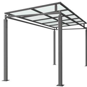
138 204 644 – 2x5 Bedford Shelter