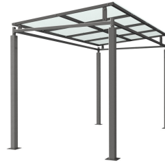
138 204 643 – 2x4 Bedford Shelter