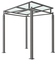
138 204 641 – 2x2 Bedford Shelter