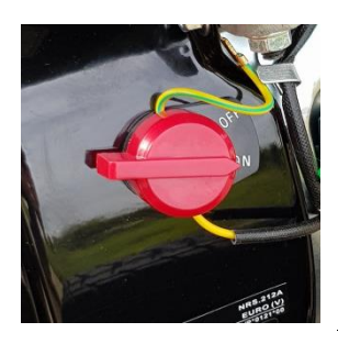
Fig1: Engine on – off switch:

Must be on when starting and switch to off position to stop motor