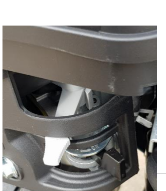
Fig4: Engine Fuel tap lever (black) and choke lever (grey)

Fig3: High pressure outlet : This is where the high-pressure hose connects.