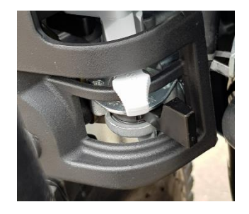
Fig5: Warm start or trouble start position - Engine Fuel tap lever (black) to the right and choke lever (grey) in centre position. Don't forget to move this choke lever immediately to the right (off position) when the engine starts running

Sometimes the engine will not start because of fuel airlock or fuel that has gone off. Please carefully follow the procedure on page 19 if you are struggling to start the engine.