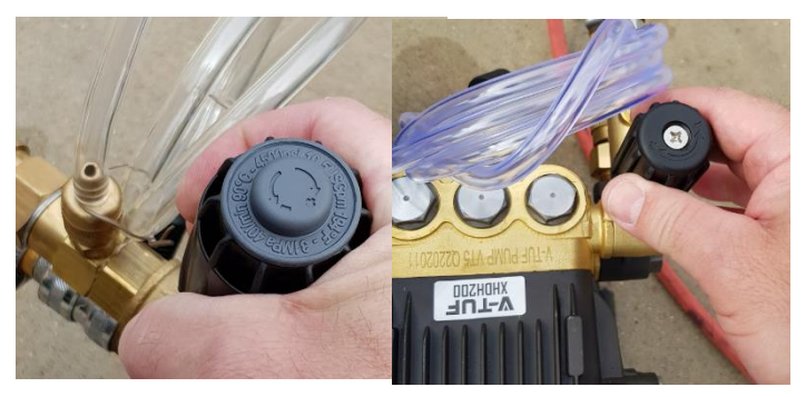
Fig2: Pressure adjustment knob to adjust the pressure on water usage of your machine (these may differ in looks) – turn anticlockwise for a lower pressure and water usage and clockwise for a higher pressure and higher water usage.

When starting the machine please note the Priming /Decompression valve positions (below)