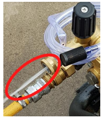
Fig3: High pressure outlet : This is where the high-pressure hose connects.