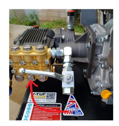
Fig. 1 Fig.2 Fig.3