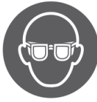
Wear eye protection