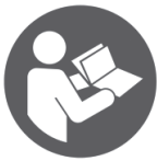
Refer to instructions

IMPORTANT: PLEASE READ THESE INSTRUCTIONS CAREFULLY. NOTE THE SAFE OPERATIONAL REQUIREMENTS, WARNINGS & CAUTIONS. USE THE PRODUCT CORRECTLY AND WITH CARE FOR THE PURPOSE FOR WHICH IT IS INTENDED. FAILURE TO DO SO MAY CAUSE DAMAGE AND/OR PERSONAL INJURY AND WILL INVALIDATE THE WARRANTY. KEEP THESE INSTRUCTIONS SAFE FOR FUTURE USE.