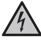
Electrical shock hazard