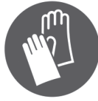
Wear protective gloves