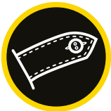
SELF FABRIC EPAULETTES