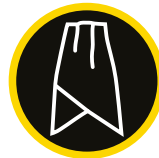
TEAM WITH OUR CRAVAT TO COMPLETE THE LOOK