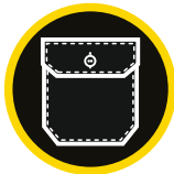
2 CHEST POCKETS WITH BUTTON DOWN FLAP