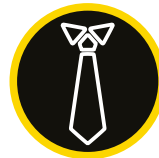
TEAM WITH OUR TIES TO COMPLETE THE LOOK