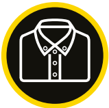
BUTTON DOWN COLLAR