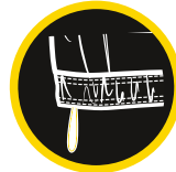
ELASTICATED HEM WITH SIDE ADJUST