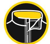
STAND UP COLLAR