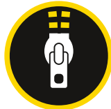
ZIPS MADE FROM RECYCLED MATERIAL