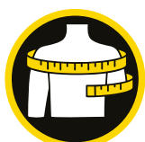
LARGE SIZE RANGE