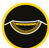
TAPED NECKLINE FOR COMFORT