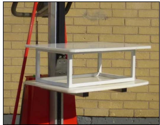
200mm Raised Frame