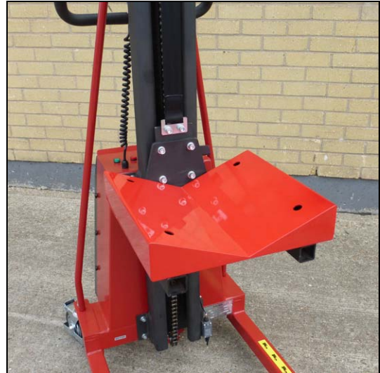
V Block – EP03 Capacity: 250kg