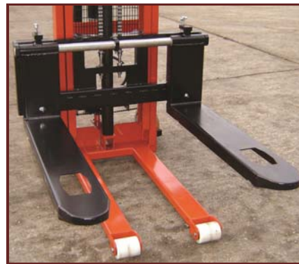
WRAPOVER ADJUSTABLE FORKS