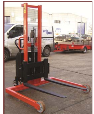
STRADDLE AND ADJUSTABLE FORGED FORKS ON ISO CARRIAGE