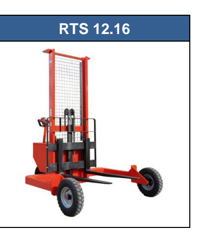
Electric Rough Terrain Straddle Pallet Stacker