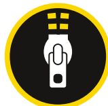
YKK MAIN ZIP LIFETIME WARRANTY