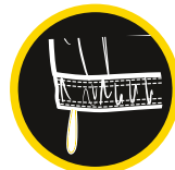
ELASTICATED HEM WITH SIDE ADJUST