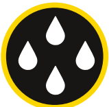
WATER RESISTANT FABRIC