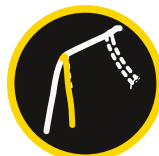
SET IN SLEEVE