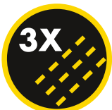
TRIPLE STITCHED SEAMS