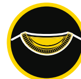
HALF MOON YOKE