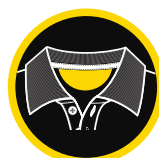
HALF MOON YOKE