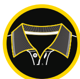
TAPED NECKLINE FOR COMFORT