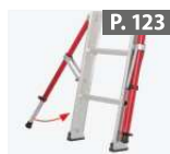
P. 123 Retrofit kit telescopic stabilisers