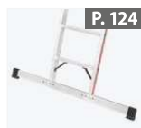
P. 124 Cross-beam for ladder section