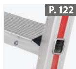
P. 122 Add-on step set for rung ladders