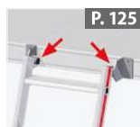
P. 125 Suspension set