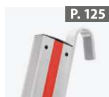
P. 125 Suspension hook set