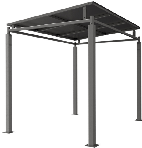
138 204 652 – 2x3 Bedford Shelter

The Bedford shelter is a free-standing, open sided shelter designed for on site assembly, constructed from galvanised mild steel. Complete with galvanised sheet flat angled roof.