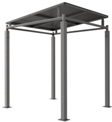
138 204 651 – 2x2 Bedford Shelter