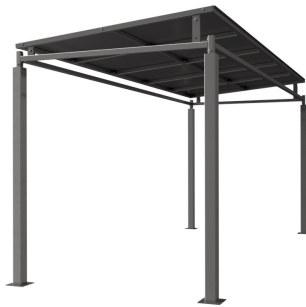
138 204 654 – 2x5 Bedford Shelter