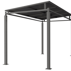
138 204 653 – 2x4 Bedford Shelter